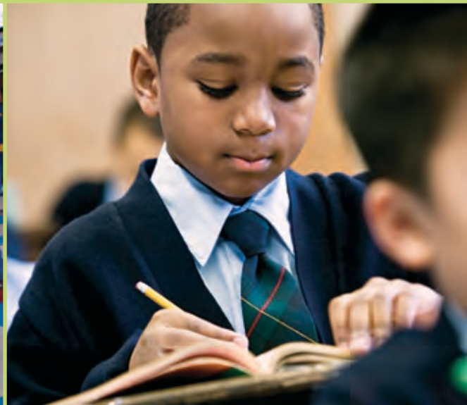
• I work hard to make my Mom and my sponsor proud