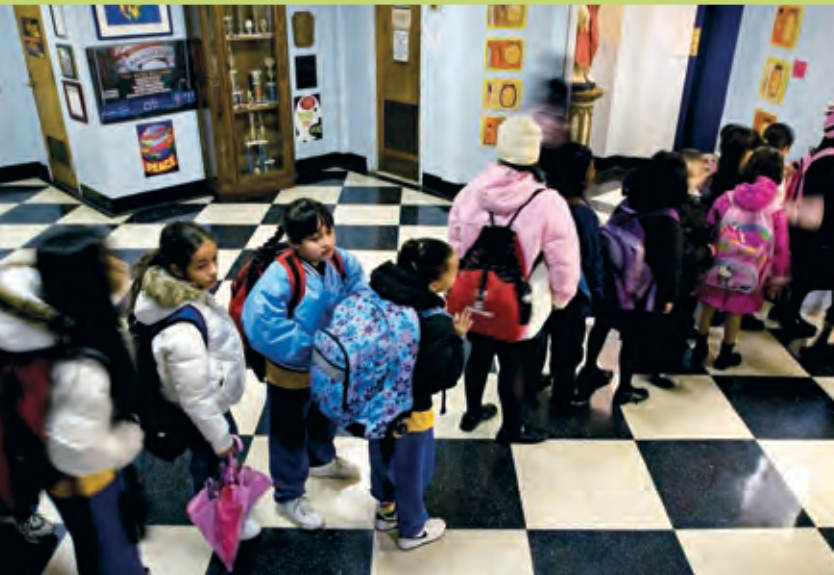
• The teacher calls out “single file”