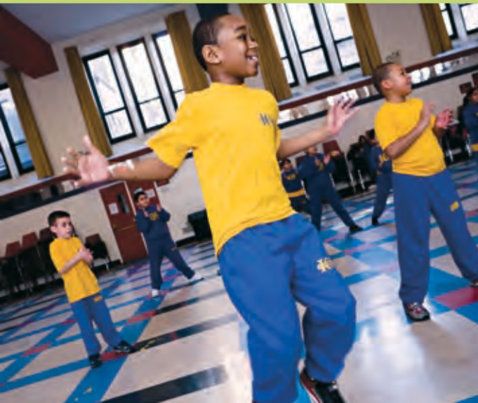
• Playing in gym