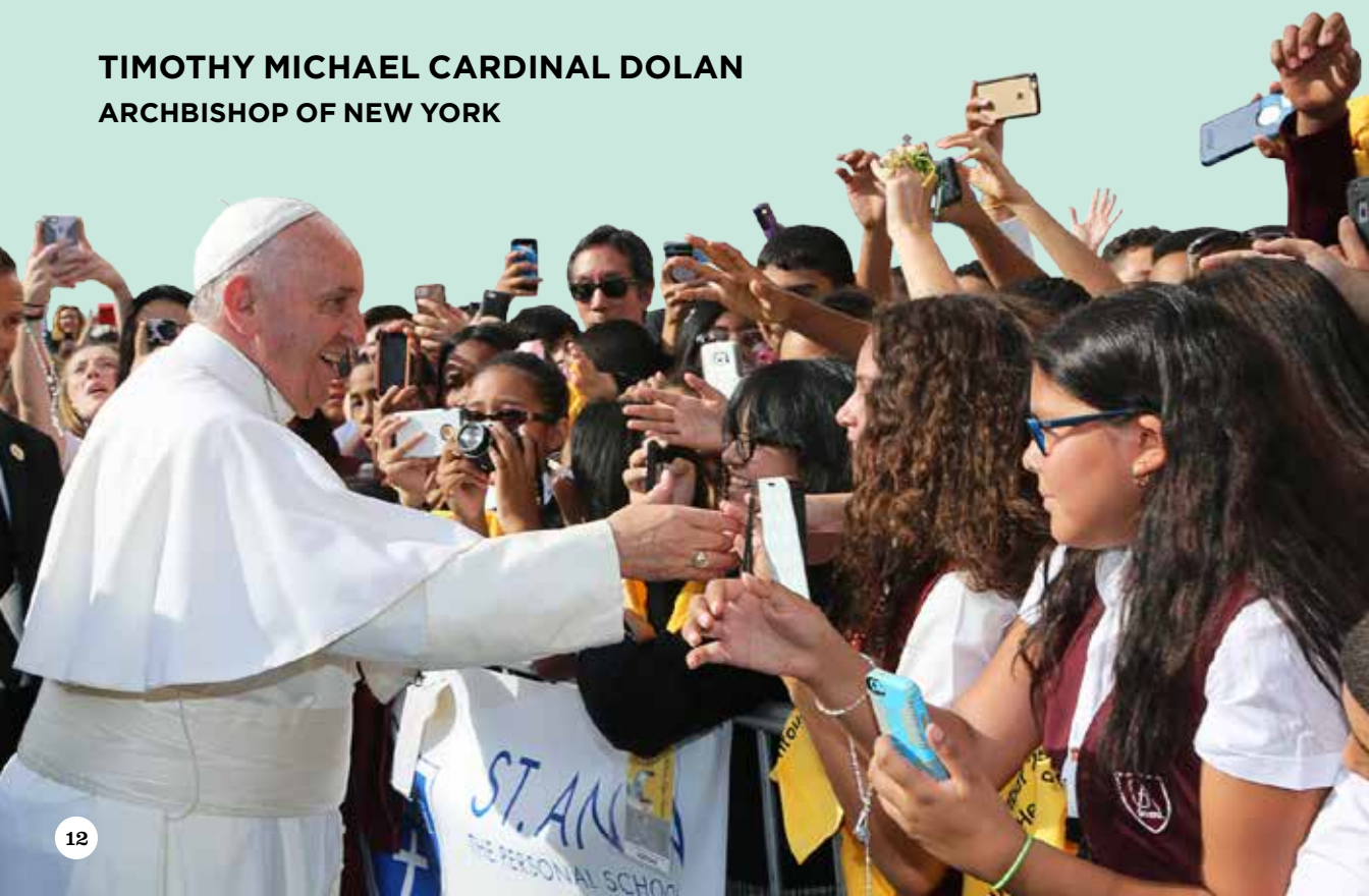
TIMOTHY MICHAEL CARDINAL DOLAN ARCHBISHOP OF NEW YORK

If you, my friends, are ever in a bit of darkness, doubt or discouragement, do what Pope Francis did: go visit our kids at one of our Inner-City Catholic schools. Pope Francis was fascinated by our students. I told the Holy Father that these kids are able to get a first-class education because of our benefactors. And he simply said, “Would you tell them that the Pope loves them and thanks them?”