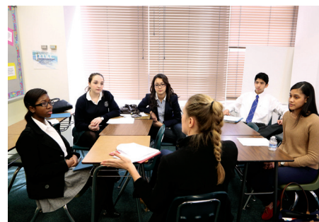
JOP students participate in job-readiness workshops with "real world" professionals