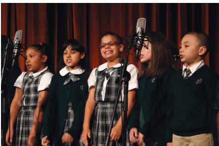
Students from ICSF-supported St. Brigid School Choir perform for guests