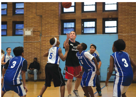
Junior Committee volunteers referee and coach basketball games for inner-city students

On May 3rd, 2013, the Junior Committee of Inner-City Scholarship Fund ended the year with a bang, raising over $30,000 at its Masquerade Ball. Over 200 young professionals donned festive masks and celebrated to raise additional funding in support of the Junior Committee's programs. This year, Junior Committee