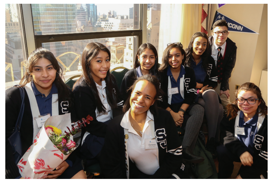
Scholarship recipients celebrate their high school graduation