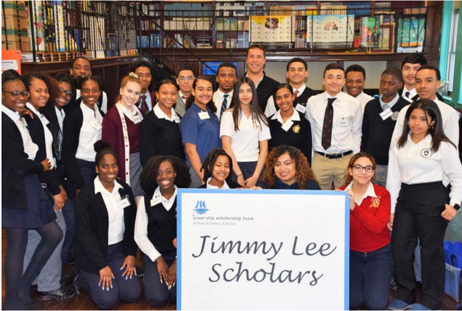
Jimmy Lee Scholars with Yankees great Mark Teixeira