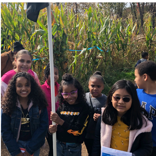
Students at Queens County Farm Museum

On October 26, students from St. John's School-Kingsbridge gathered with the Junior Committee of Inner-City Scholarship Fund at Queens County Farm Museum for a day of fall fun. The day's activities included visiting the petting zoo, taking pony rides, getting lost in the Amazing Maize Maze, and making it through a spooky Haunted House.