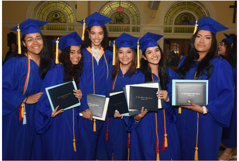
Recent Catholic school graduates preparing for college

PeerForward and College Advising Corps each work to prepare high school students for college by working with an adviser. PeerForward trains a select group of students to serve as peer advisers for their fellow high schoolers, and College Advising Corps uses a recent college graduate from the same area to come back and work with