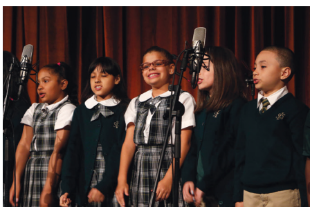
Students from ICSF-supported St. Brigid School Choir perform for guests