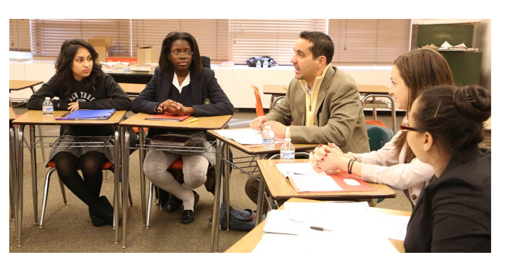
High school juniors participate in job-readiness workshops through the Job Opportunities Program

On Saturday, May 16th, volunteers and Inner-City supported students completed the last of this semester's six Job Opportunities Program workshops. During each session, volunteers help guide students through a job-readiness curriculum