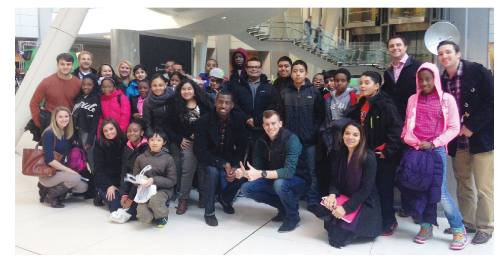
Junior Committee volunteers take 6th graders from Corpus Christi School to the American Museum of Natural History

The Junior Committee is comprised of young professionals who volunteer their time to provide over 5,000 underprivileged students with access to a number of programs, including tutoring, basketball, field trips and holiday parties. In addition, the Committee hosts several social events throughout the year to give its volunteers an opportunity to network with other young professionals.