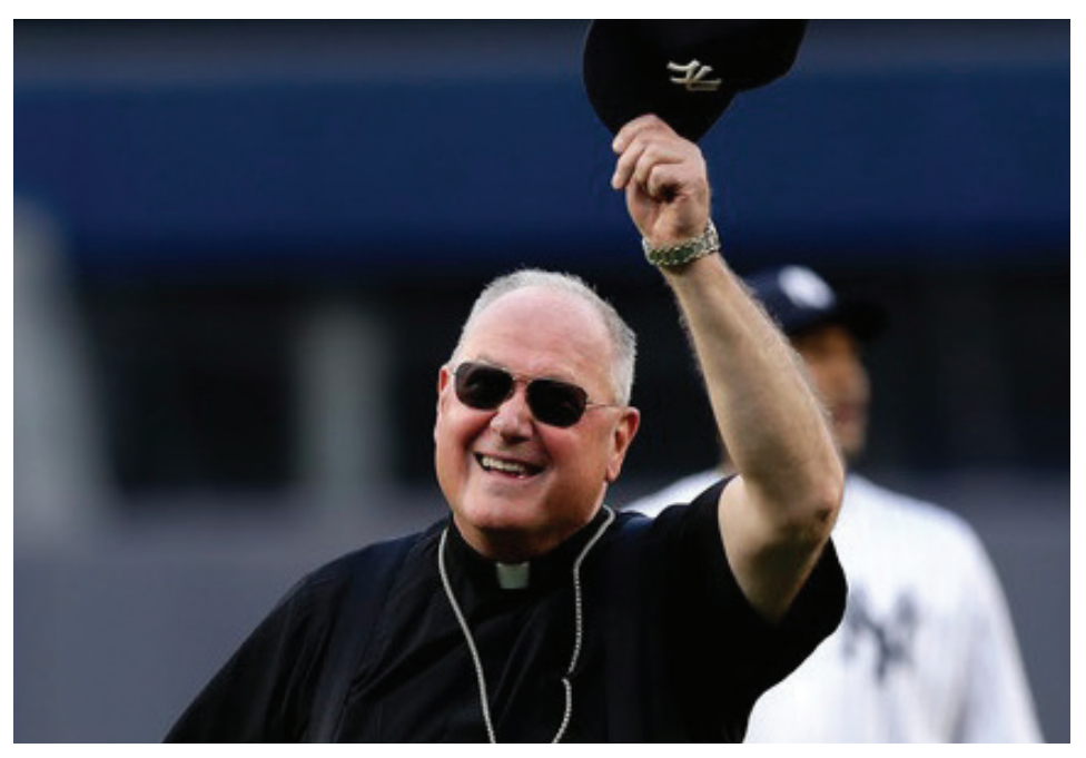
Cardinal Dolan waves to the crowd after throwing out the first pitch

In 2012, the Archdiocese of New York's Department of Education began the process of Regionalization: a transition from a parish-based school system to a regional model divided among nine geographic areas. Each of the nine regions is a separate, not-for-profit, educational corporation chartered by