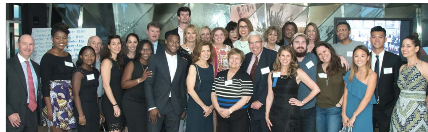
Members of the Capital Improvements Committee at Top of the Rock for this year's cocktail reception

More than three hundred guests joined His Eminence Timothy Cardinal Dolan on Tuesday, June 20, for the Capital Improvements Committee's Annual Cocktail Benefit. The event was held at Top of the Rock Observation Deck at Rockefeller Center. Nearly $200,000 was raised through ticket sales, raffle prizes, and a silent auction that included a six-night African Safari, a three-night stay in Turks & Caicos, and several other featured packages.