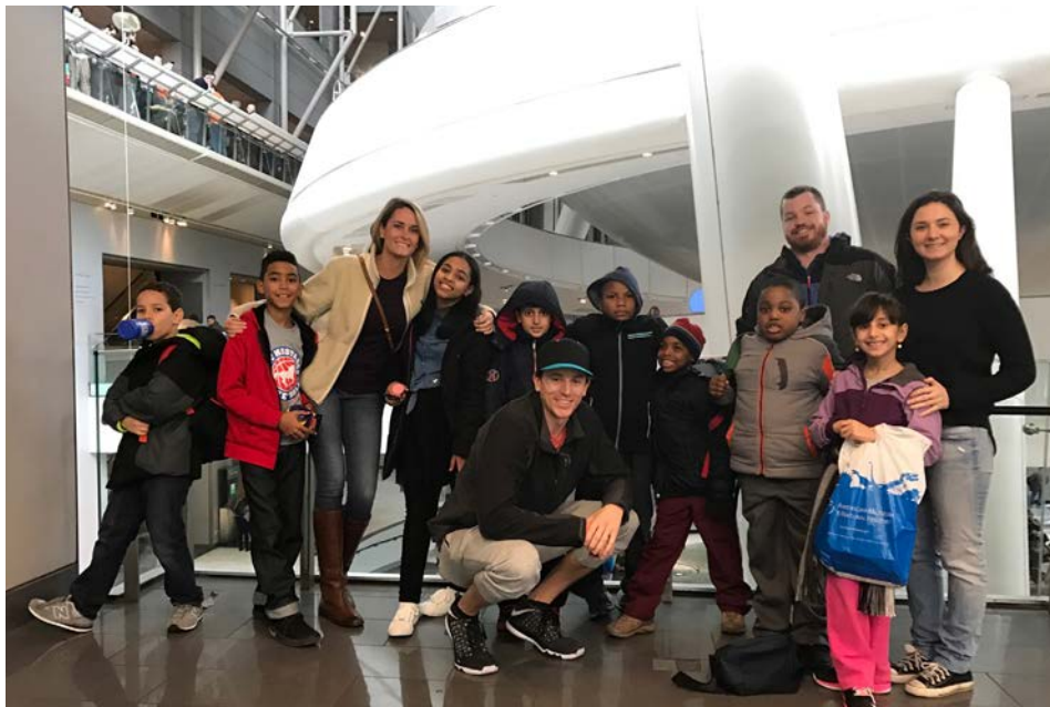
Junior Committee volunteers and students at the American Museum of Natural History

On April 21, nearly three hundred attendees, including over one hundred first-timers, gathered on the Harbor Lights yacht for a night of dinner and dancing at the annual Spring Soiree fundraiser. Guests enjoyed networking,