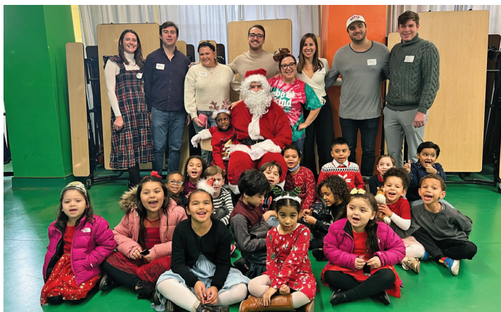
Junior Board volunteers with students at Christmas party

The Juniors have also hosted several school holiday parties and field trips for inner-city students since the beginning of the school year. In December, they hosted a Christmas party where students and volunteers made Christmas themed arts & crafts, cookies, and even had a visit from Santa. In February, they celebrated Valentine's Day with arts and crafts, cupcake decorating and creating Valentine cards to send to friends and family. Most recently, they organized a field trip to the Museum of Natural History.