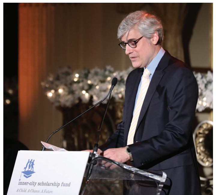
Mo Rocca at the 45th Annual Awards Dinner

Save the date for Inner-City’s 46th Annual Awards Dinner on Tuesday, November 28th.